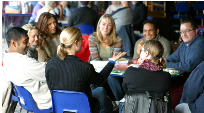
An Alpha course small group

Where is the Alpha course running? In 34,000 locations in 163 countries around the world. Courses are running in places as diverse as churches, universities, schools, homes, prisons, pubs, hotels, offices and factories, sheltered accommodation, and armed forces bases.